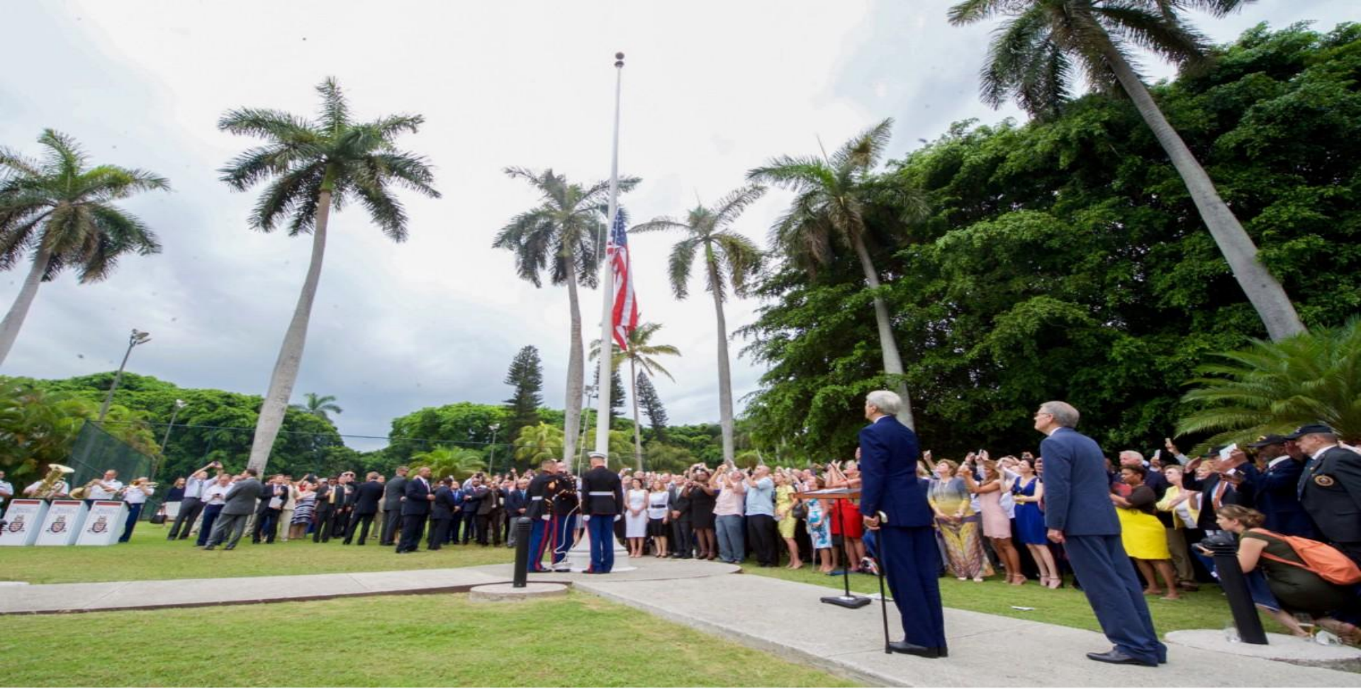
Secretary of State, John Kerry, restoring diplomatic relations in Havana, Cuba, on August 14, 2015.